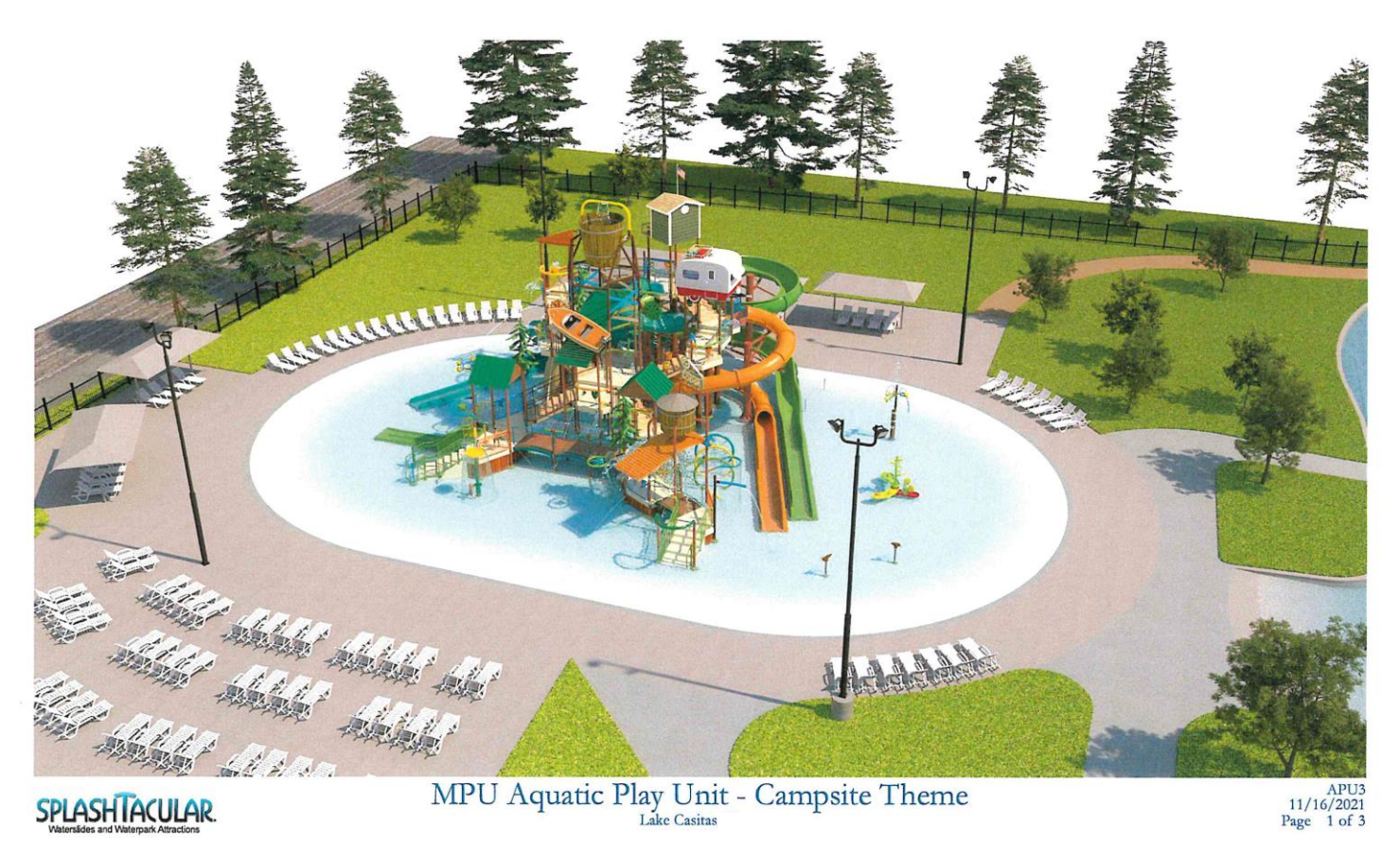
© 2021 Splashtacular, LLC, All Rights Reserved The drawings, designs, and content contained herein are the exclusive property of Splashtacular, and may not be reproduced, distributed, or promoted without the written consent of Splashtacular, or its authorized representative

This APS is similar to Whitewater's AP1750, with the exception of an additional slide and a customizable theme (campsite theme shown). This structure would be expected to have a similar instantaneous capacity to that of the Whitewater AP 1750 (540 guests). As of March 2022, the cost of the structure was $1,385,299 and the installation cost is estimated at $255,528 for an estimated total cost of $1,640,827 .