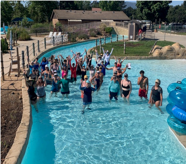
Day 1 Water Aerobics 2024