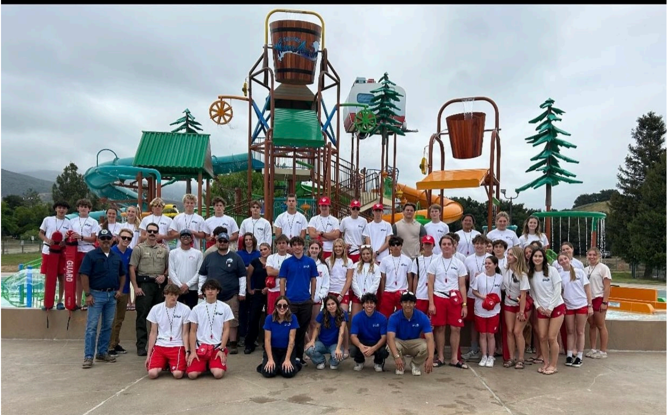
2024 CWA Lifeguards