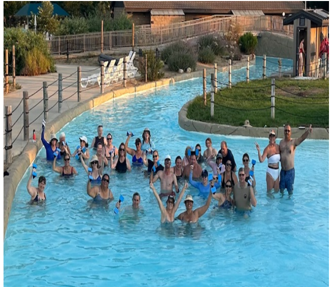
Day 1 Evening Water Aerobics