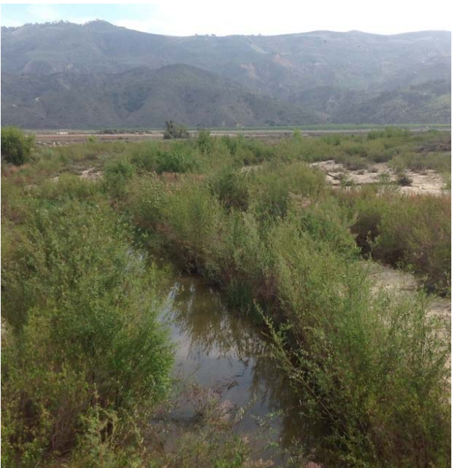
Looking Downstream from the Hwy. 126 Bridge toward the Confluence with the Santa Clara River - March 23, 2014