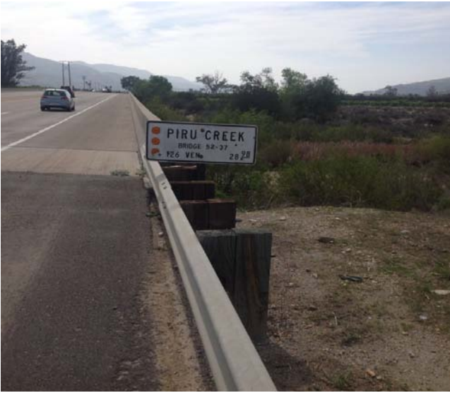
Piru Creek Bridge - March 23, 2014