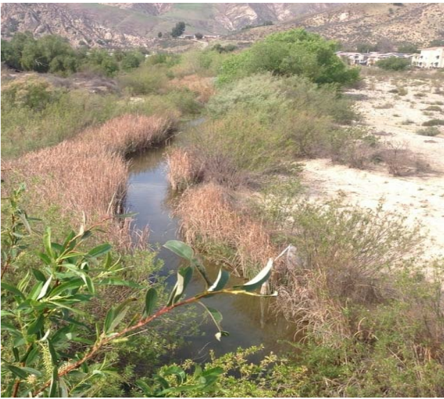
Looking Upstream Toward the Community of Piru from the Hwy.126 Bridge - March 23, 2014