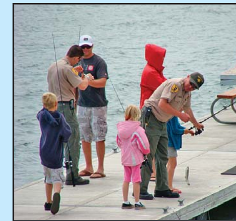
Lake Casitas Recreation Area Free Kids Fishing Day is Saturday, March 24, 2012.

Youths under the age of 16 can enjoy some fishing for free and they don't need a license. Anglers ages 16 and 17 are welcome, but they must possess a valid fishing license required by the Department of Fish and Game.