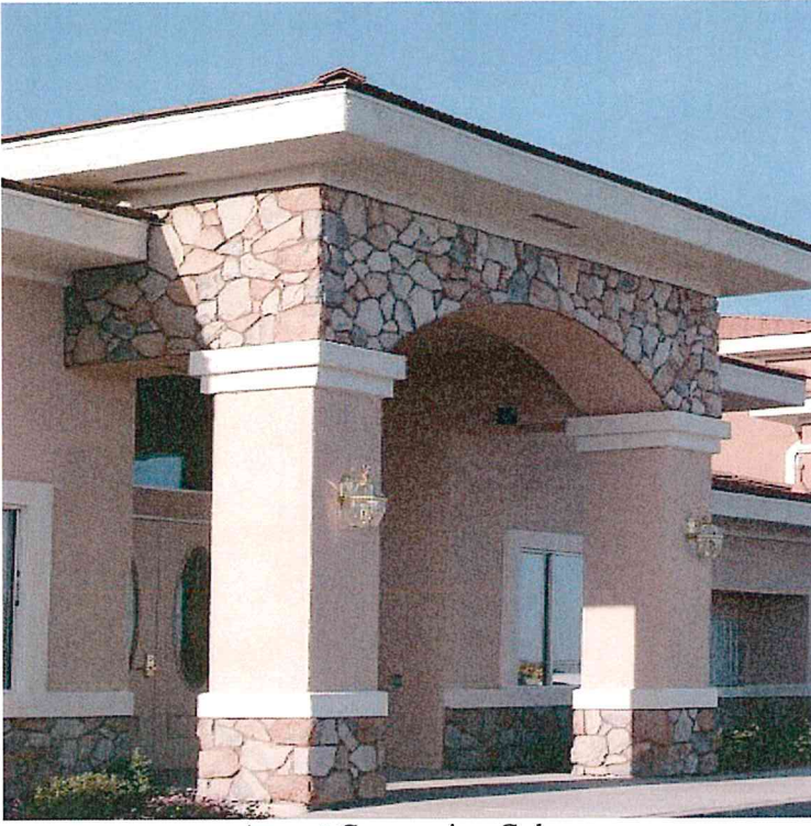
Accent Companion Colors