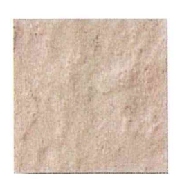
Accent Color:Mojave Stone Styles/Colors: Cordovan Mendocino