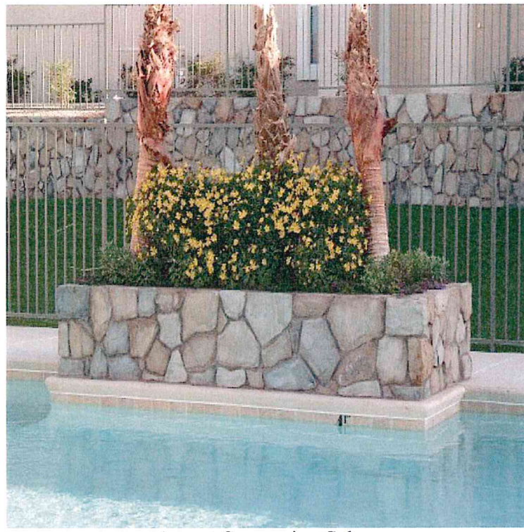
Accent Companion Colors