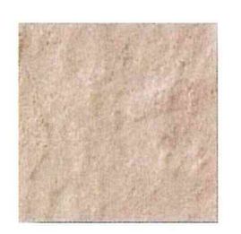
Accent Color:Mojave Stone Styles/Colors: Cordovan Mendocino