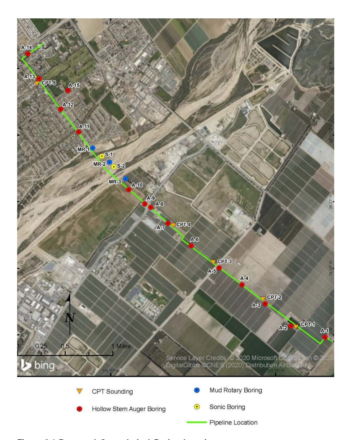
Figure 2-1 Proposed Geotechnical Boring Locations